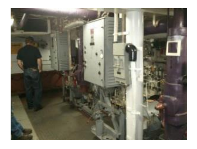
3rd Deck Tour - ICE Equipment Control Room