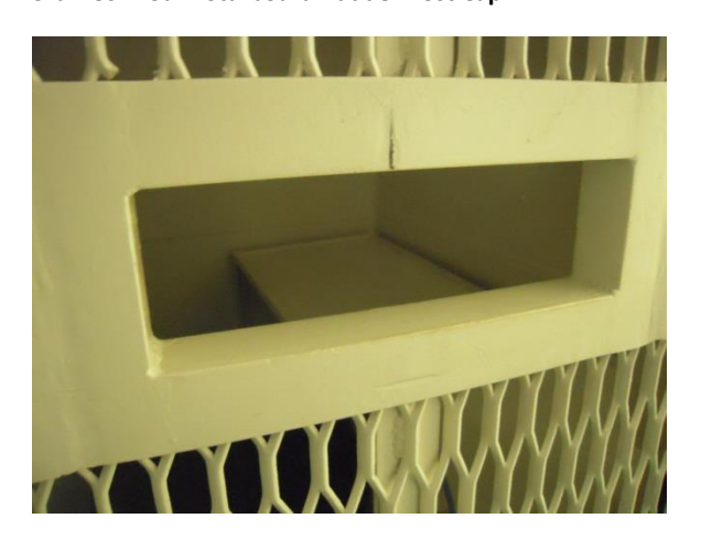
3rd Deck Tour - Solitary Lock Up