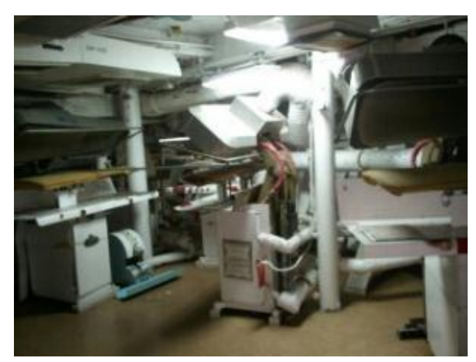
3rd Deck Tour - Laundry Equipment