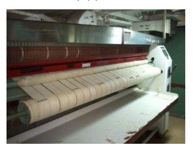
3rd Deck Tour - Sheet Press