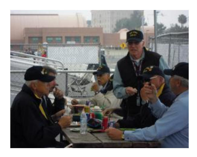
Crew Potluck on Friday, March 15