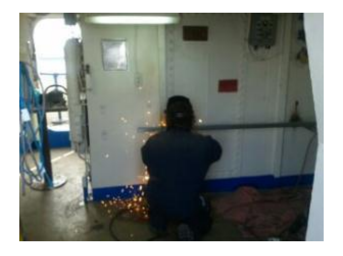
Welding table supports for the new Forward Quarterdeck