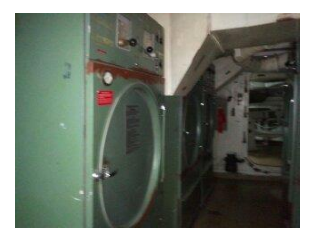
3rd Deck Tour - Laundry Equipment