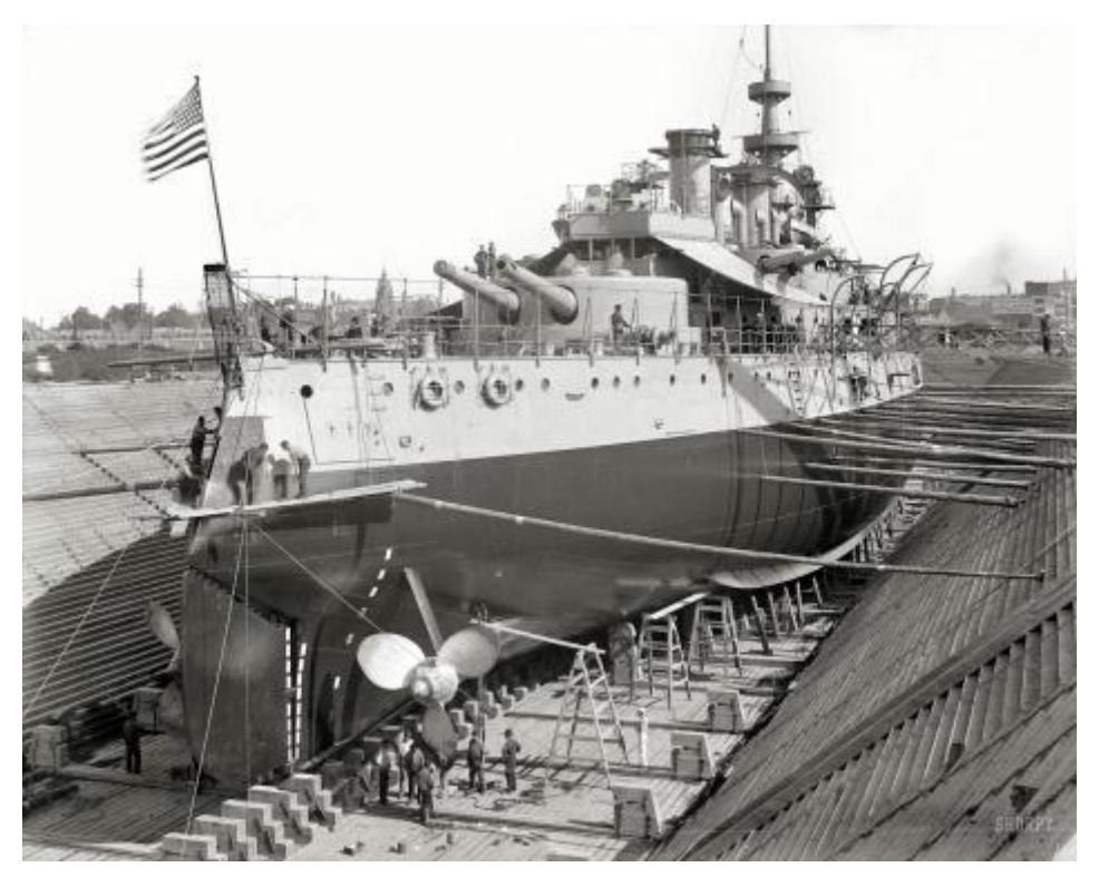
USS Oregon in dry dock, Brooklyn Navy Yard, 1898