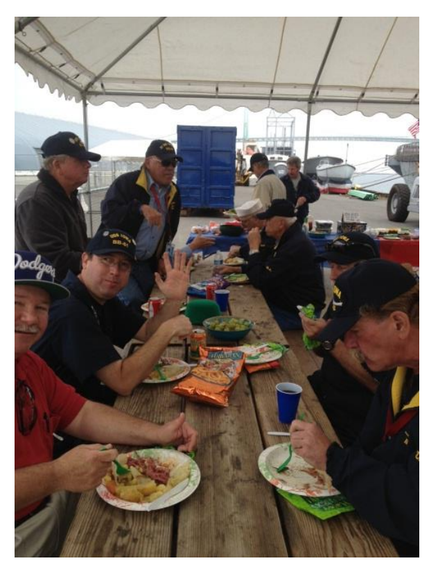
Crew Potluck on Friday, March 15th